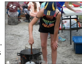
Cooking on the Campfire