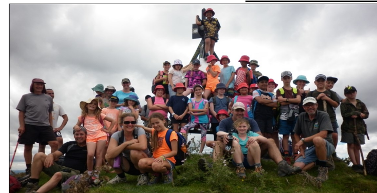
Hiking to the 'Trig' - WE MADE IT!