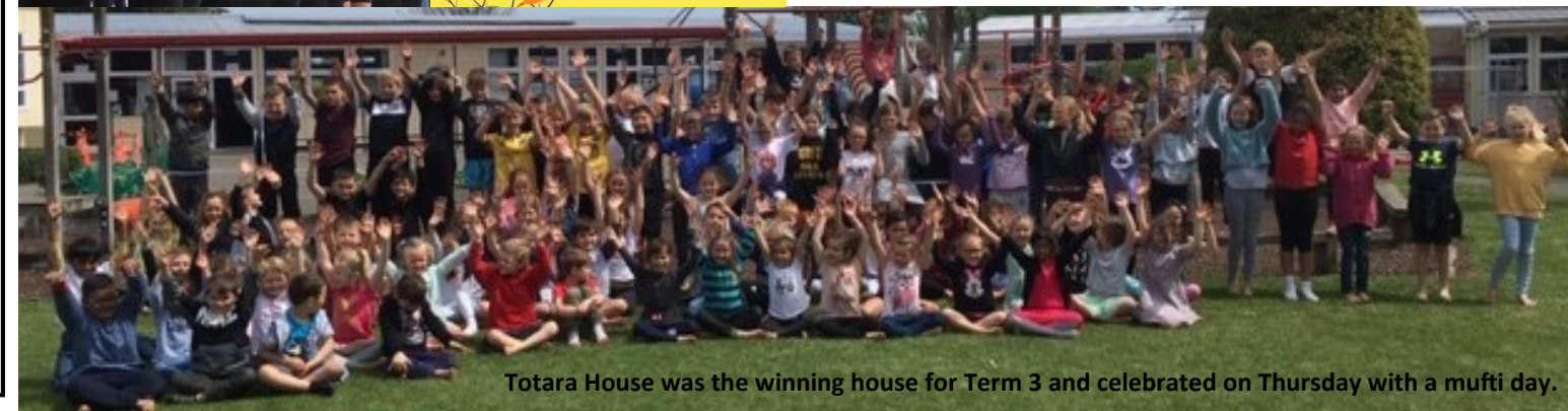
Totara House was the winning house for Term 3 and celebrated on Thursday with a mufti day.

Always treat people the way you want to be treated. Talk to people the way you want to be talked to. Respect is earned not given.