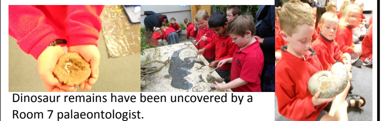
Dinosaur remains have been uncovered by a Room 7 palaeontologist.

The robot dinosaurs were awesome because they looked so real and they were scary when they roared loudly. The dinosaur dig was exciting and the fossils were so amazing because they were hundreds of thousand years old!!